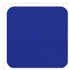
Blu Royal - 970