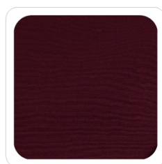
Vinaccia - 190