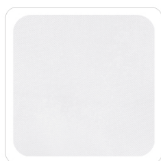
Bianco - 500